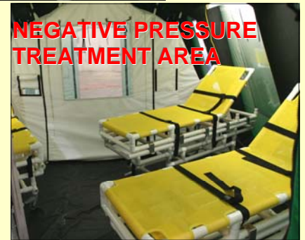
NEGATIVE PRESSURE TREATMENT AREA