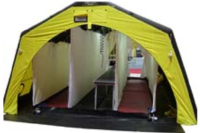
Mdl 311-L3-E, Three-Lane Decon System w/ Non-Ambulatory shown