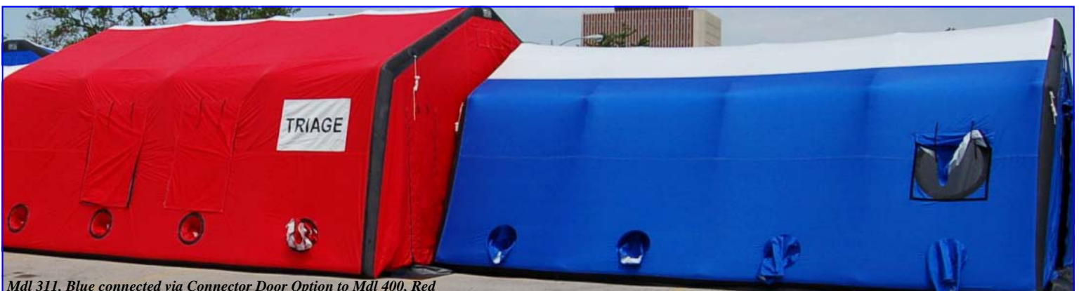
Mdl 311, Blue connected via Connector Door Option to Mdl 400, Red